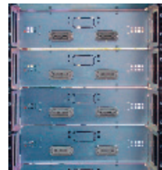
Drawer types units