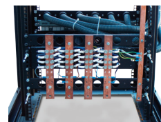
500A Power bars